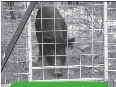
A pig caught in one of the traps that LHPA rangers distributed to landholders.

Although pig numbers are not high density, South East LHPA rangers saw an opportunity to control the